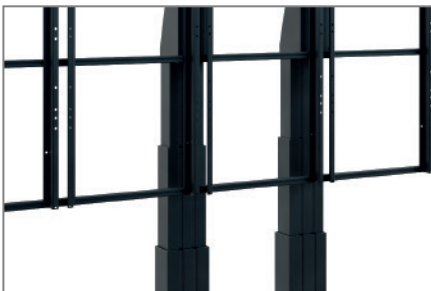
Motorised height adjustment - 700 mm travel way

In addition to the pre-configured systems, HAGOR offers customised special solutions in the LED sector, which can be individualised with accessories such as loudspeakers, controls and so on to meet all requirements.