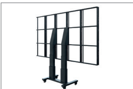
No fine adjustment necessary